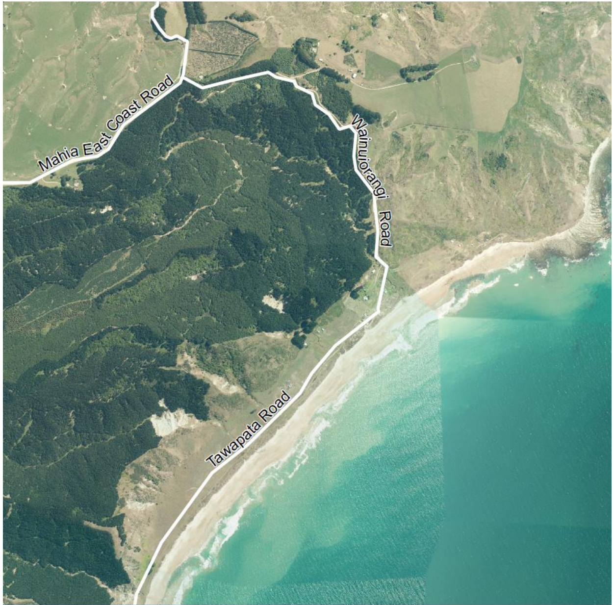
Map A – Taiwananga